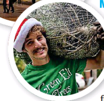
Ho, ho, ho: Mariah Carey, top, Oxford Street's LED curtains and Green Elf Trees. Right, from top, a winter cabin at Pergola, Macaulay Culkin in Home Alone and Will Ferrell in Elf

one million twinkling bulbs and the Tate Britain's illuminated "brave new world" winter display are among this year's most spectacular.